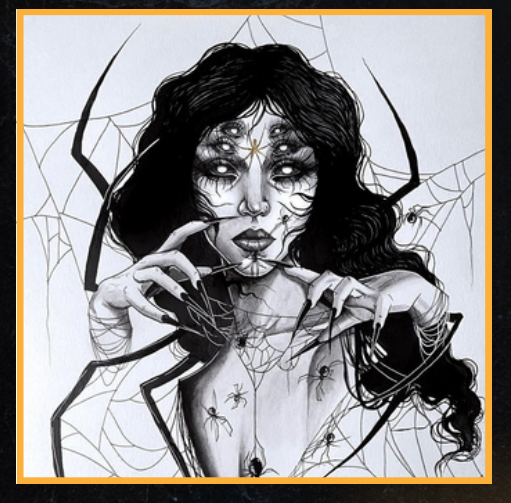
JESSICA LAUSER Ink on Strathmore 300 Series Bristol Paper

In the dark, eerie night, we unveil a gallery of fright. Spiders and ghouls rendered just right, these spooky pieces are full of delight.