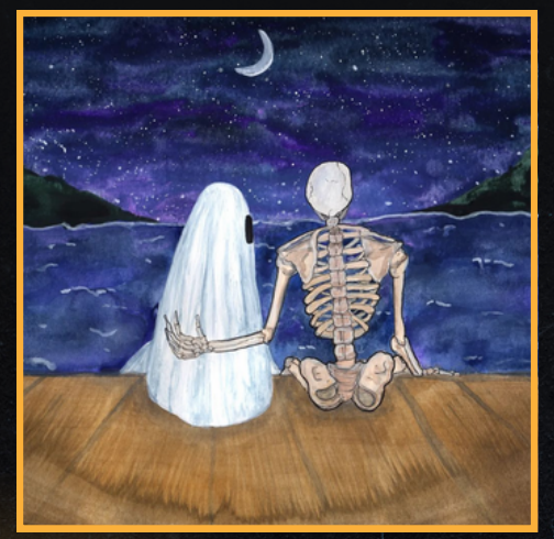
FLUKE LADY Watercolor on Strathmore 400 Series Watercolor Paper