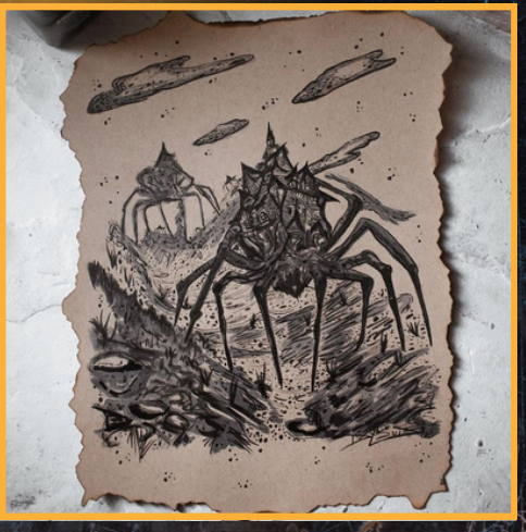
DAISY SUD Ink on Strathmore 400 Series Toned Tan Mixed Media Paper