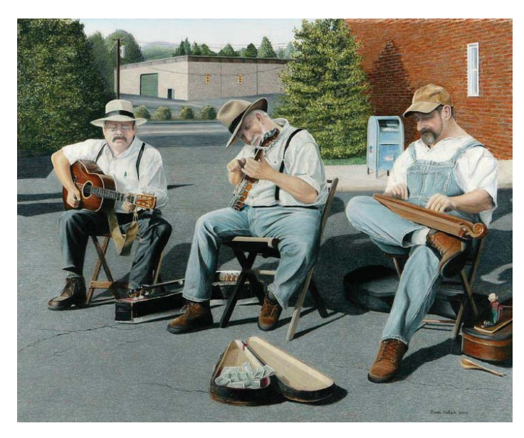
Street Songs Colored Pencil Mark Fortier