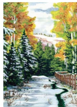
Winter at Sunlight Basin Rhonda Green, AZ