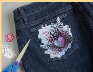
Stretches without cracking or peeling

Now artists and crafters can express themselves on fabric without the limitations of traditional transfer sheets.