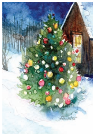
The Night Before Delilah Fiechter, CO