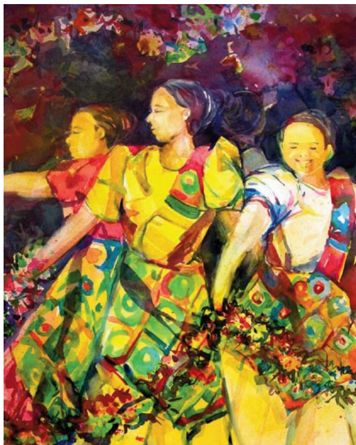
Band of Sisters

Although my parents said I was born to be an artist, it was only after my father's sudden demise in my early twenties