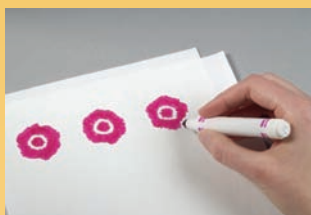
Draw directly on transfer sheets

Create brilliant, opaque images on dark-colored fabric.