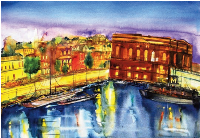
Romancing the Harbor