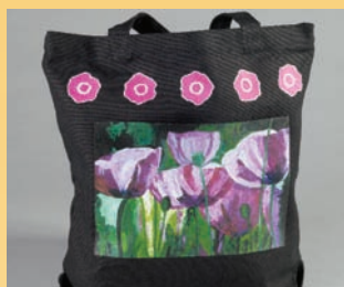
Combine inkjet images with your drawings