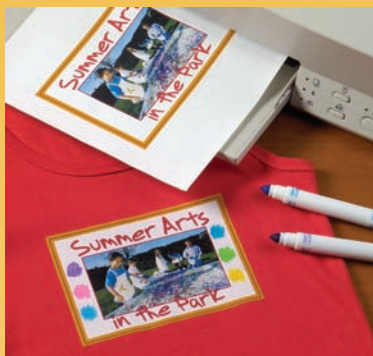
Creates soft, stretchable images