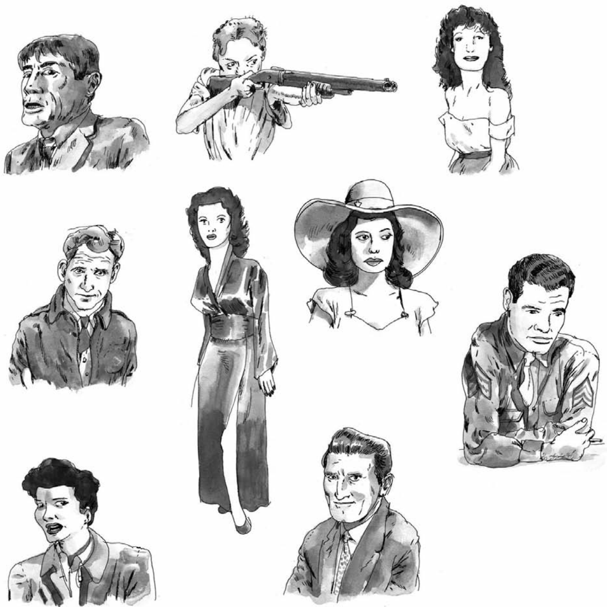
Actors That Have Been In Movies With Robert Mitchum, for The Believer Strathmore® 400 Series Medium Drawing

up there to take reference photos for the drawings was a great part of the job.