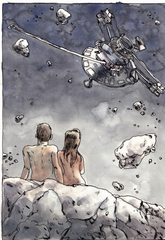
Pioneer 10, for Port Magazine