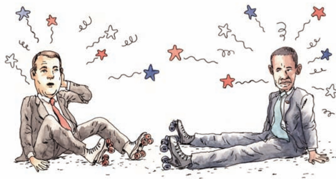
Boehner and Obama After Their Big Debt Deal, for Bloomberg View Strathmore® 400 Series Medium Drawing

There is also this fascination I have with drawing the debris that exists around objects. I think this stems from living in the city as well; flakes of filth that fall off a seagull in flight, the gum spots that decorate a sidewalk, crumbs breaking from a sandwich, or the specks of dirt that hover around a shoe that has walked on the street