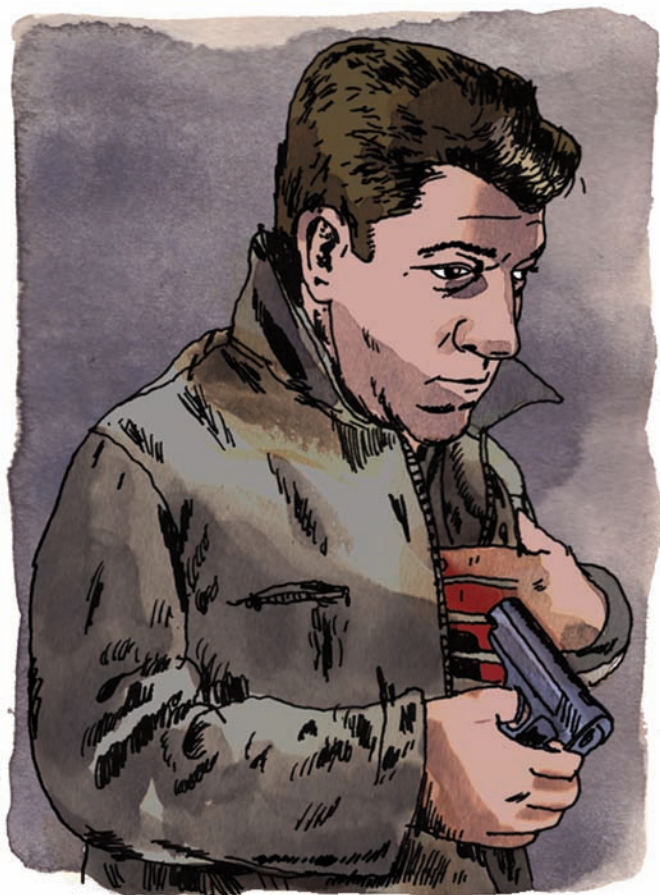
Jean Gabin in Daybreak, for The New Yorker Strathmore® 400 Series Medium Drawing

New York really is a limitless source of inspiration. Living here has helped me develop my drawing skills because I'm constantly surrounded by reference material. Whenever I work on a drawing, I always have a visual reference file in my mind for different types of fire hydrants, dogs, buildings, people, cars, ways of standing, conversational gestures, etc. Walking around the city is like an ongoing life drawing class. Just by paying attention, you can learn about the way forms are built up, without necessarily drawing them. Of course, the drawing part never hurts.