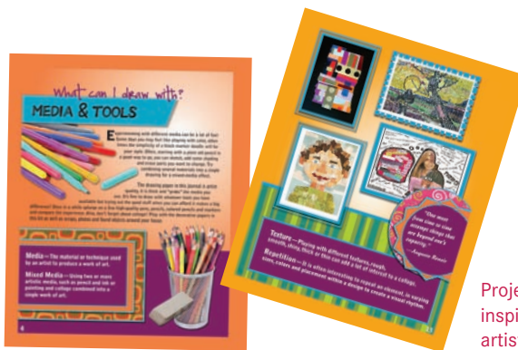
Project pages inspire young artists!

Assorted handmade and bright construction papers provide textures and colors, perfect for collage!