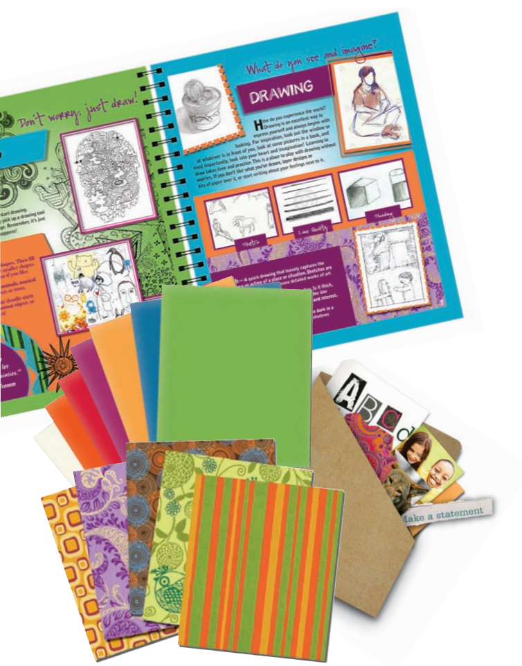
Assorted papers provide textures and colors, perfect for collage!

The Strathmore® Art Journal Kit is a place where kids can explore their creativity, learn fun drawing and collage techniques and use artist quality materials. These exciting new kits are perfect gifts for young artists.