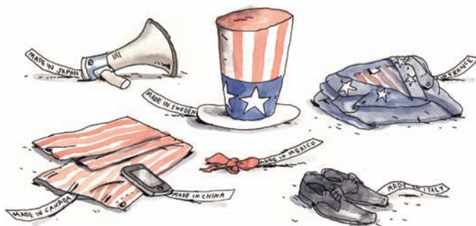
Manufacturing America's New Middle Class, for Bloomberg View Strathmore® 400 Series Medium Drawing

When I was younger, drawing in high school and college, I was into doing reportage type assignments, capturing a lot of the places where I hung out. A few years ago I