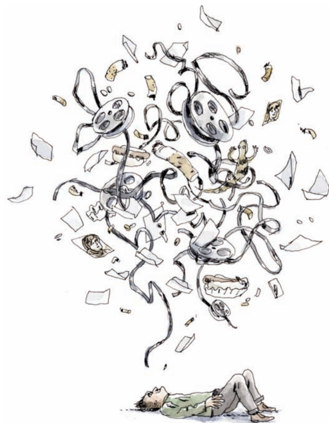
Go Get Some Rosemary, for Red Bucket Films

Growing up and living in New York City has given me endless drawing possibilities. I do a lot of drawings of the city in my free time, and I think that is reflected in my professional illustration work. The combination of pristine