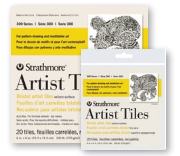
BRISTOL Available in 4" x 4" packs and 6" x 6" glue bound pads.