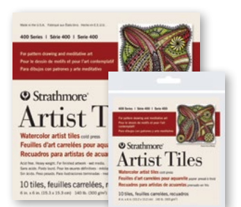
WATERCOLOR Available in 4" x 4" packs and 6" x 6" glue bound pads.