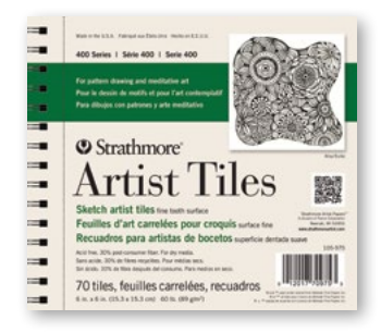
RECYCLED SKETCH Available in 6" x 6" journal style wire bound pads.

Find out more about our Artist Tiles on our website or YouTube channel.