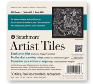
BLACK Available in 6" x 6" glue bound pads.