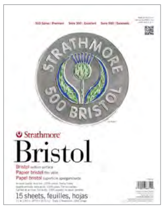
500 Series Bristol Plate and Vellum

Both surfaces available in tape bound pads and sheet stock.