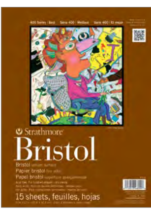
400 Series Bristol Smooth and Vellum

Both surfaces available in tape bound pads, sheet stock, and rolls. bound pads and sheet stock.