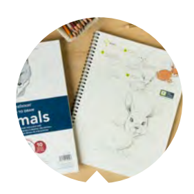
The Learning Series from Strathmore Learn from a pro -more-