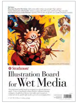
500 Series Illustration Board Dry and Wet Media

Both surfaces available in tape bound pads and sheet stock.