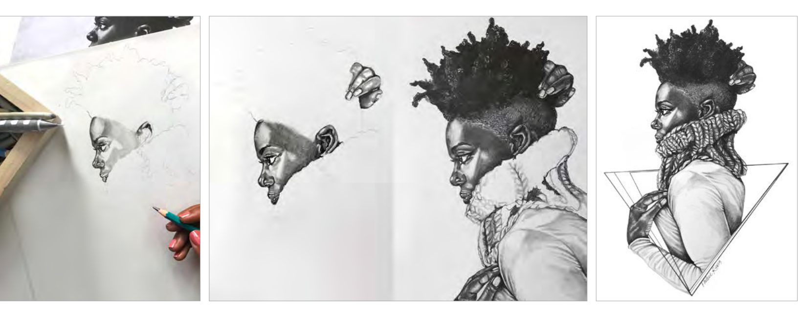
Sarita: in progress - 400 Series Smooth Bristol

of their story, with every inflection unique to them. It's the main reason why eyes are always my starting point with every piece. Anchoring the piece with the eyes which is yet another way I like to create a strong foundation, to blocking out shadows as the image begins to emerge. Watching that person come to life right before you, when