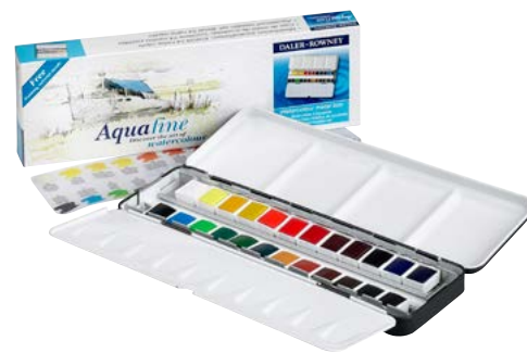
Daler-Rowney Aquafine Watercolor Pan Set 24 colors