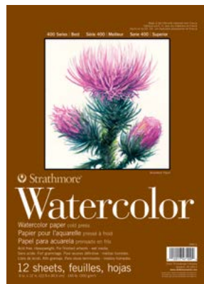
Strathmore 400 Series Watercolor Block or pad 9 x 12", cold press, 140lb / 300 gsm