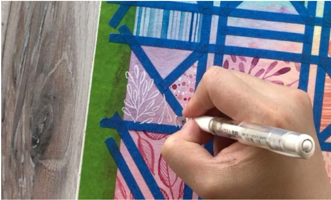
Adding designs using a white gel pen